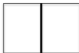
You have a log!