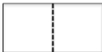
Fold it in half